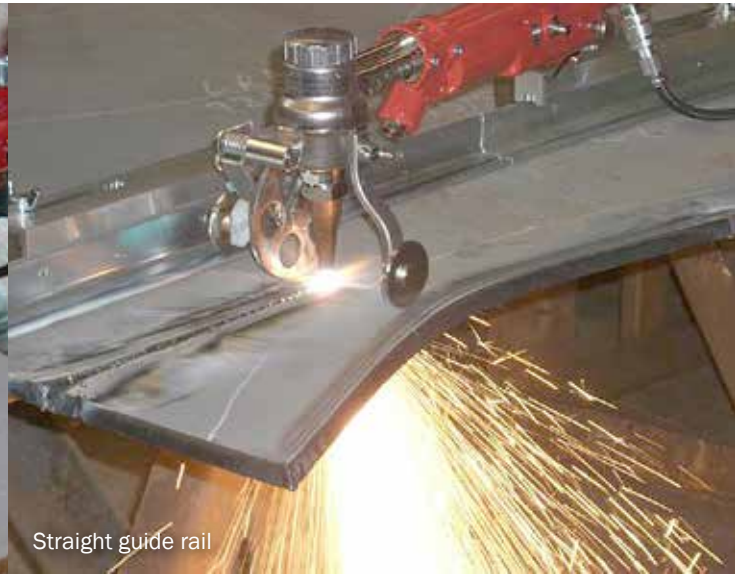
Straight guide rail