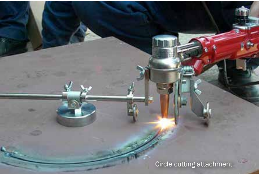
Circle cutting attachment