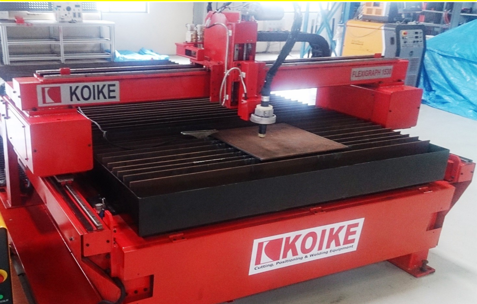
Table Integrated Plasma Cutting Machine

with a range of cutting width 1,550mm and length 3,050mm